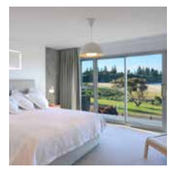
Building Designer: AJF Designs